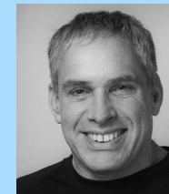
Uri Levine 2x Unicorn Builder-Waze & Moovit, Author of "Fall in Love with the Problem, Not the Solution"